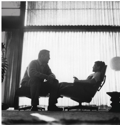
In their home in the Pacific Palisades, the Lounge Chair had a permanent place. Its comfort was also loved by a good friend of the Eameses, the film director Billy Wilder.