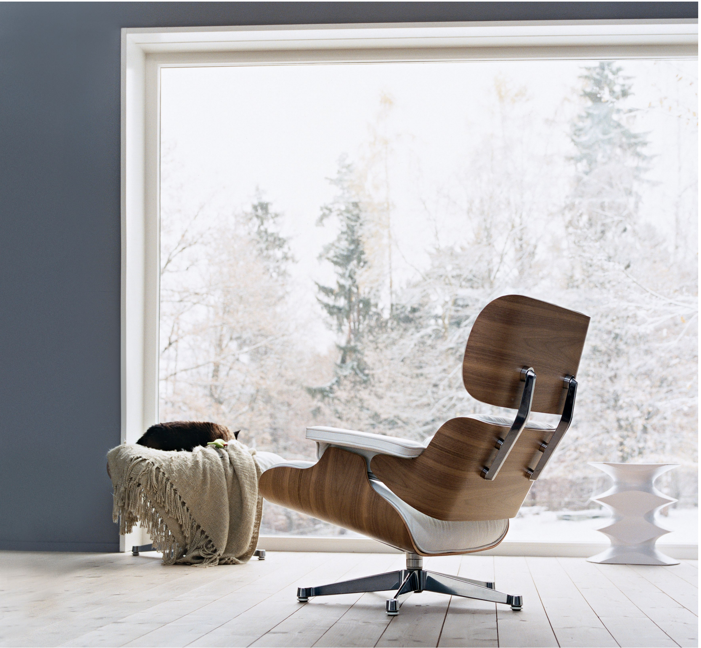
The lighter-toned version of the Lounge Chair, which features white-pigmented walnut veneer, polished aluminium and white leather, was developed by Vitra in collaboration with the Eames Office.